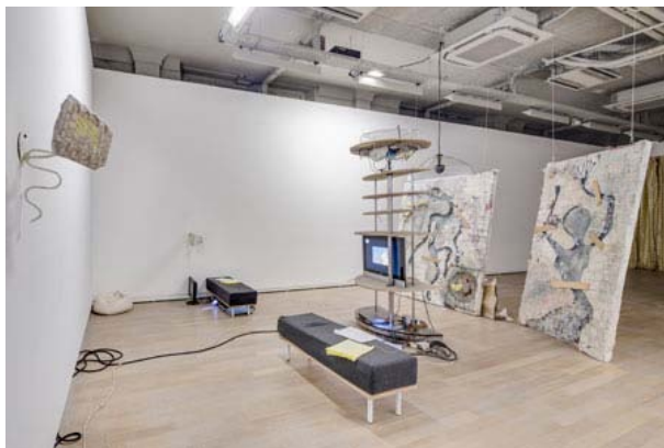
(Island of Lost Souls, 2012)