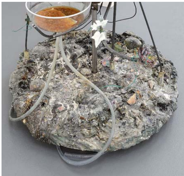
(SICK S4LIVA (vegetativ-them), 2013)