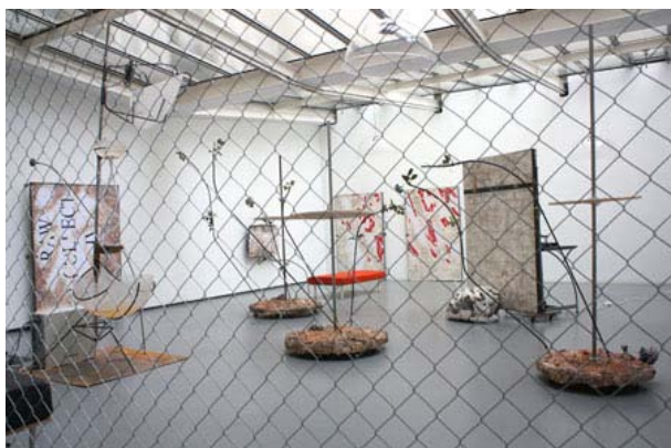
(Installation view, Sick Saliva, Valentin, Paris, 2013)