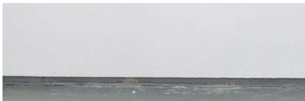
(Mo Lick, 2012)