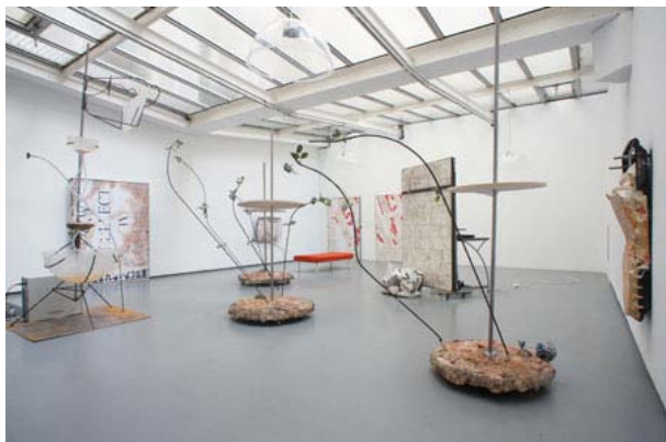
(Installation view, Sick Saliva, Valentin, Paris, 2013)