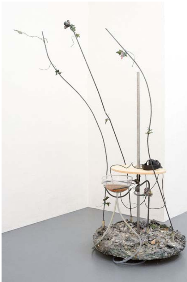
(SICK S4LIVA (vegetativ-them), 2013)