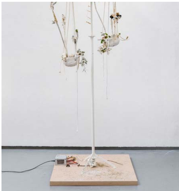
(City Sickness, 2012)